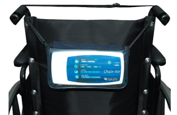
For use with Chair-Air™, Geriatric Recliner Mattress & Chair-Air™ Wheelchair Cushion

The portable Chair-Air™ AC/DC Pump allows your patient to be totally mobile. A rechargeable battery backup keeps this system working up to 6 hours per charge, based on the patient's weight.