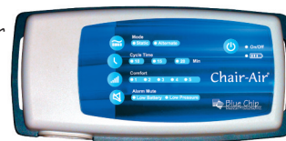
CHAIR-AIR™ AC/DC 9701 ALTERNATING PUMP

Dimensions: 14.5L" x 5W" x 12.5H" Weight: 16 lbs. Electrical: A/C 117V/60 hz D/C 12V 7 amp/hr Listings: UL CE Cycle Time: 10, 15 or 20 Minutes Air Flow: 4 - 6 Liters Ground Resistance: 0.1 ohms maximum