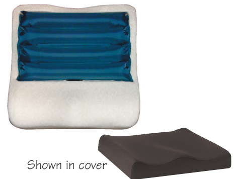
Shown in cover

Four individual bladders alternate to provide the patient a superior pressure redistribution seating surface while the unique molded design, with slight abductor pommel, stabilizes the hips and keeps the patient in proper mid-line alignment. The zippered non-skid, stretch-knit cover is anti-microbial and fire-retardant. The Chair-Air™ 9700CAF includes the Chair-Air™ 9701 alternating pump.