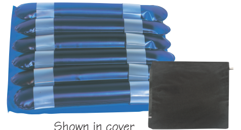
Shown in cover

Six individual bladders alternate to provide the patient a superior pressure redistribution seating surface. The zippered non-skid, stretch-knit cover is anti-microbial and fire-retardant. The Chair-Air™ 9700C includes the Chair-Air™ 9701 alternating pump.