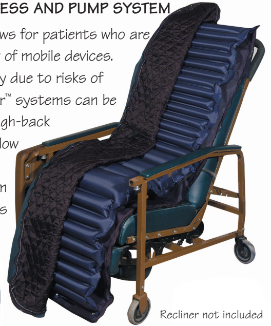
Recliner not included