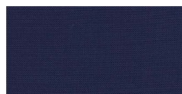
SILVERTEX SAPPHIRE BLUE