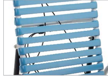
Individualized fit for superior comfort