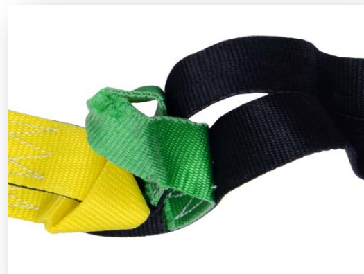
Stiffened and Brittle Loop Strap

Permanent crease, wrinkles along with brittleness increase chance that the fabric will suffer more damage from abrasion, internal fiber abrasion as well as external abrasion with other objects. Wash cycles with excessive agitation will increase abrasion and degradation of the fabric.