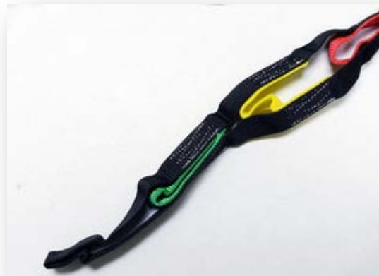
Permanent Creasing of Loop Strap