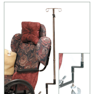
Telescopic IV Pole