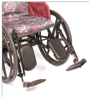
Vinyl Elevated Leg Rest