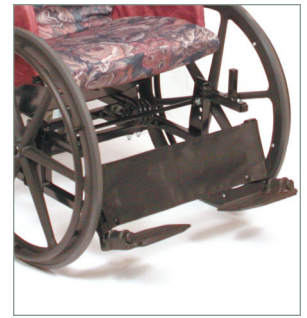
Fabric Heel / Leg Strap