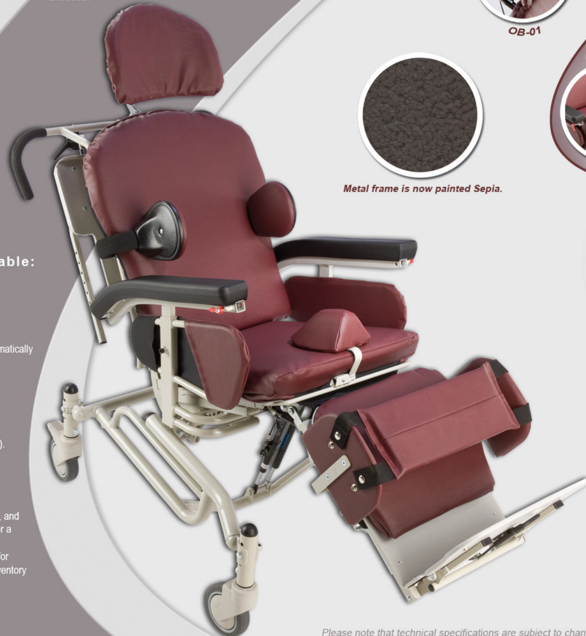
Metal frame is now painted Sepia.

Please note that technical specifications are subject to change without notice.