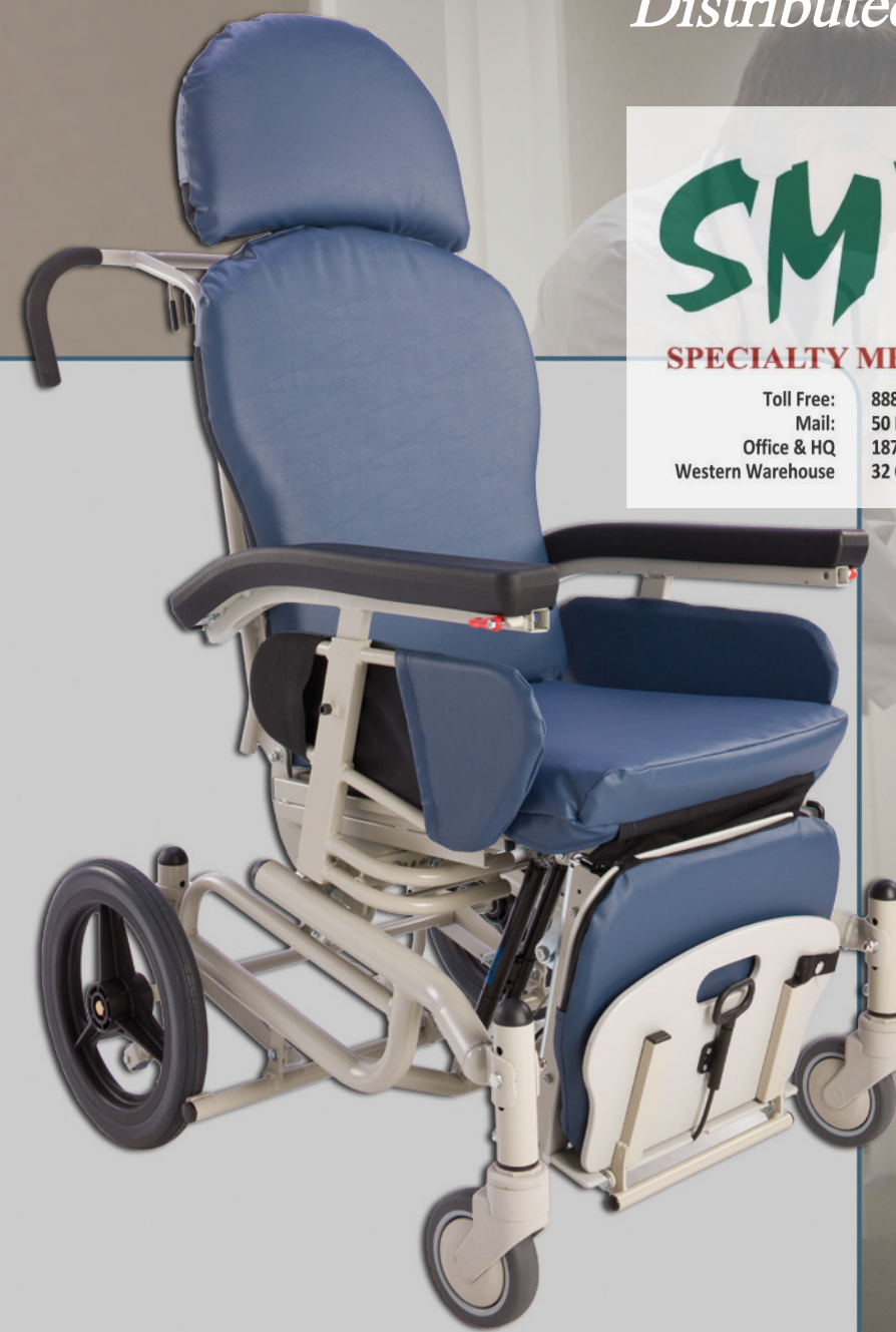
THE COMPLETE POSITIONING CHAIR.