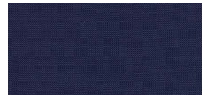
SILVERTEX SAPPHIRE BLUE